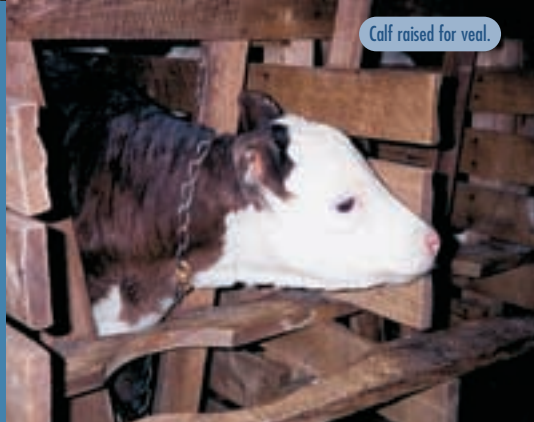
Calf raised for veal.

“Urban Sprawl Benefits Dairies in California” New York Times , 10/22/99