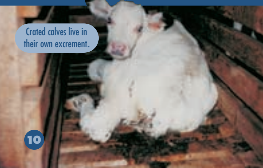
Crated calves live in their own excrement.