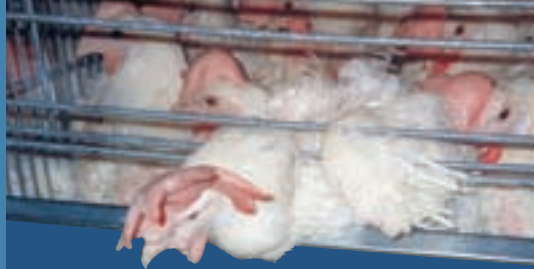
Above: Tooth clipping, debeaking, dehorning, tail docking, branding, and castration are standard agricultural practices—often performed without anesthesia. 11 Right: Entangled in the bars of her cage, a hen is left with no access to food or water.

Historically, man has expanded the reach of his ethical calculations, as ignorance and want have receded, first beyond family and tribe, later beyond religion, race, and nation.