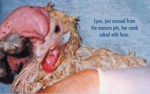
Lynn, just rescued from the manure pits, her comb caked with feces.

With increased knowledge of the behaviour and cognitive abilities of the chicken, has come the realization that the chicken is not an inferior species to be treated merely as a food source.