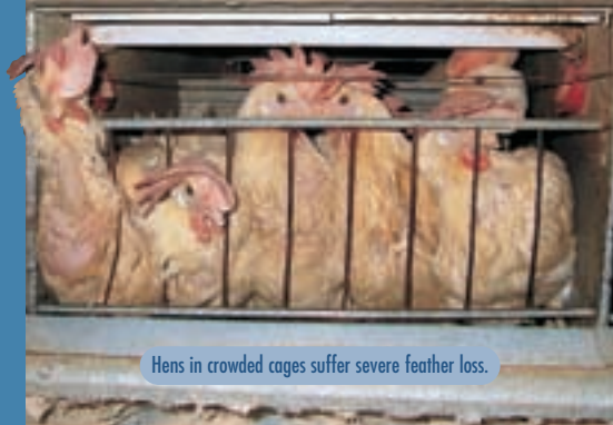
Hens in crowded cages suffer severe feather loss.

Farm Animal Welfare , Iowa State University Press, 1995