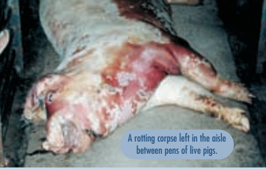
A rotting corpse left in the aisle between pens of live pigs.