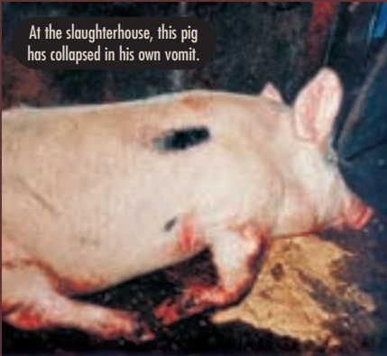
At the slaughterhouse, this pig has collapsed in his own vomit.

“Hogs, unlike cattle, are dunked in tanks of hot water after they are stunned to soften the hides for skinning. As a result, a botched slaughter condemns some hogs to being scalded and drowned. Secret videotape from an Iowa pork plant shows hogs squealing and kicking as they are being lowered into the water.” 18