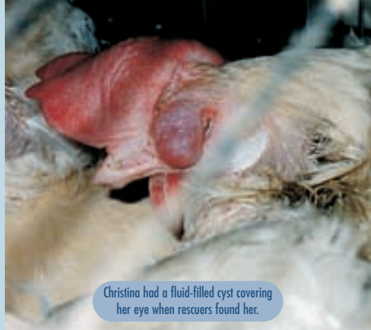
Christina had a fluid-filled cyst covering her eye when rescuers found her.

The hens, practically featherless and very despondent when rescued, were given a second chance at life. One year later, Jane's seven friends are alive and doing well—enjoying a virtual paradise compared to their former existence inside a factory farm. Unfortunately, approximately 280 million hens remain in U.S. battery cages.