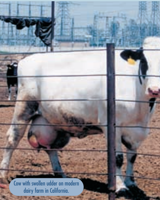
Cow with swollen udder on modern dairy farm in California.

Today’s pig farmers have done just that. As Morley Safer related on 60 Minutes : “This [the movie Babe ] is the way Americans want to think of pigs. Real-life ‘Babes’ see no sun in their limited lives, with no hay to lie on, no mud to roll in. The sows live in tiny cages, so narrow they can’t even turn around. They live over metal grates, and their waste is pushed through slats beneath them and flushed into huge pits.” 7