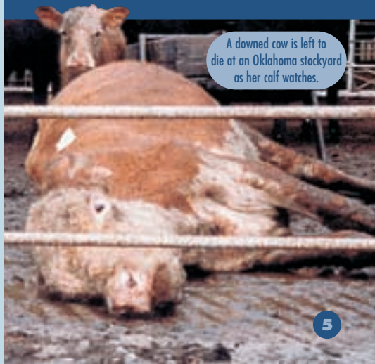
A downed cow is left to die at an Oklahoma stockyard as her calf watches.

interview with a Canadian livestock trucker from A Cow at My Table , 1998 documentary