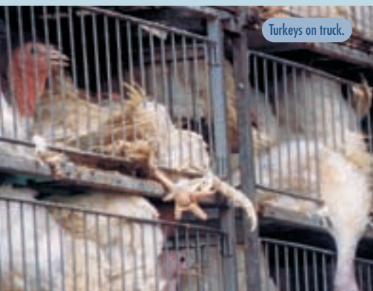
Turkeys on truck.

Transport Crammed together, animals must stand in their own excrement while exposed to extreme weather in open trucks, sometimes freezing to the trailer. 12 These conditions can result in “downers”—animals too sick or weak to walk, even when shocked with electric prods or beaten. Downers are dragged by chains to slaughter or to “dead piles” where they are left to die. 13